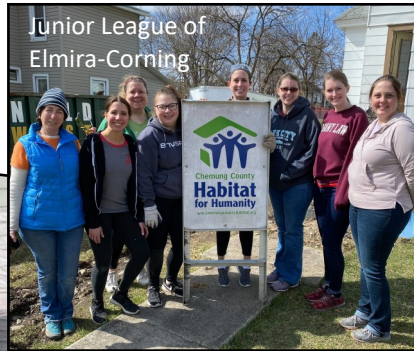
Junior League of Elmira-Corning