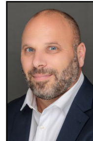
M&T Bank