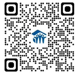
Chemung County Habitat Donation Website

Together, we're building more than homes — we're building hope .